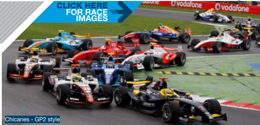
Chicanes - GP2 style